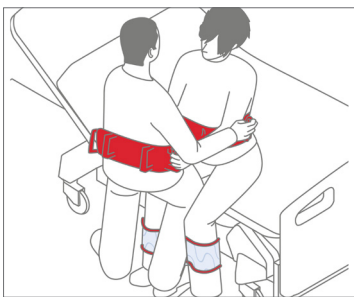
Illustration with both PM-3012, PM-3015 & PM-3005